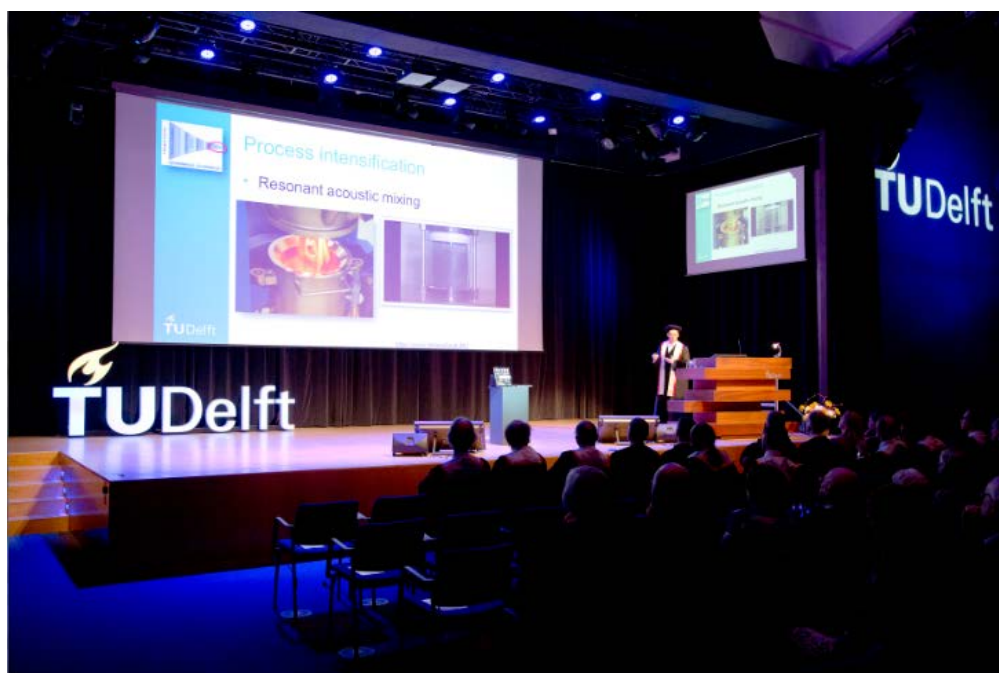
Audience and lecturer thinking about resonant acoustic mixing.

A second cornerstone of this chair is the development of models that can predict the properties of energetic materials before actually making them. As a result, spending time and money on a variety of new materials that will ultimately never be used, can be avoided. In the long term, one might even start thinking of designing new energetic materials, based on these models. For those who could not attend the inaugural address, a recording of the ceremony is available here .